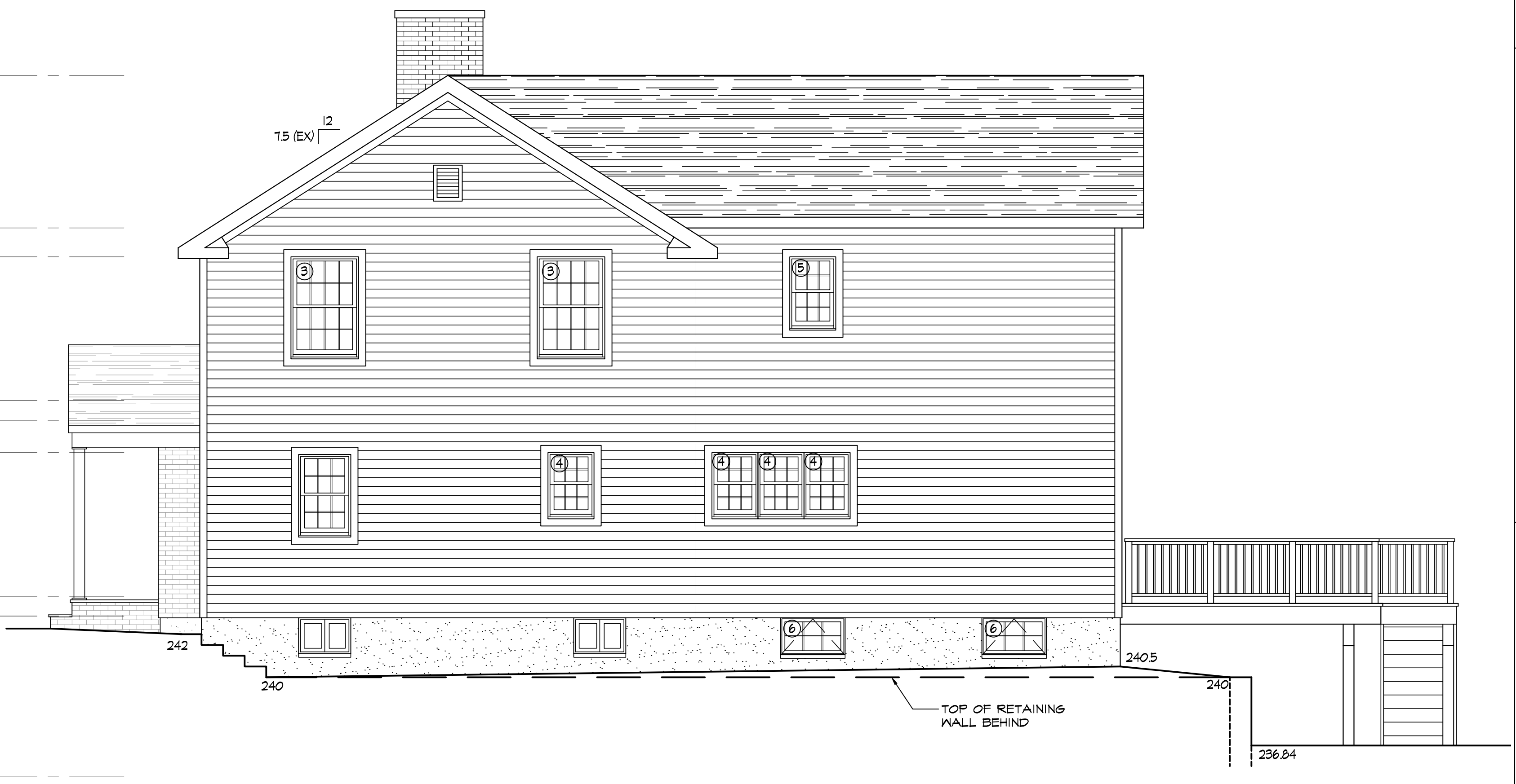
SIDE ELEVATION SCALE: 1/4"=1'-0"