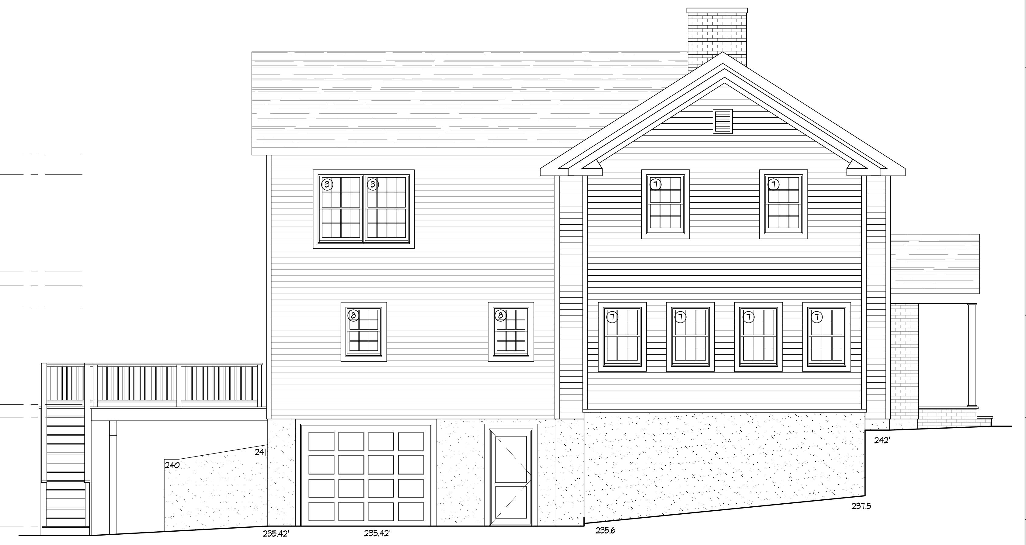
SIDE ELEVATION SCALE: 1/4"=1'-0"