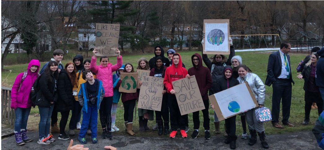
October 2019 CEAC tour by Dobbs Ferry elementary school garden & food scrap diversion parent leader