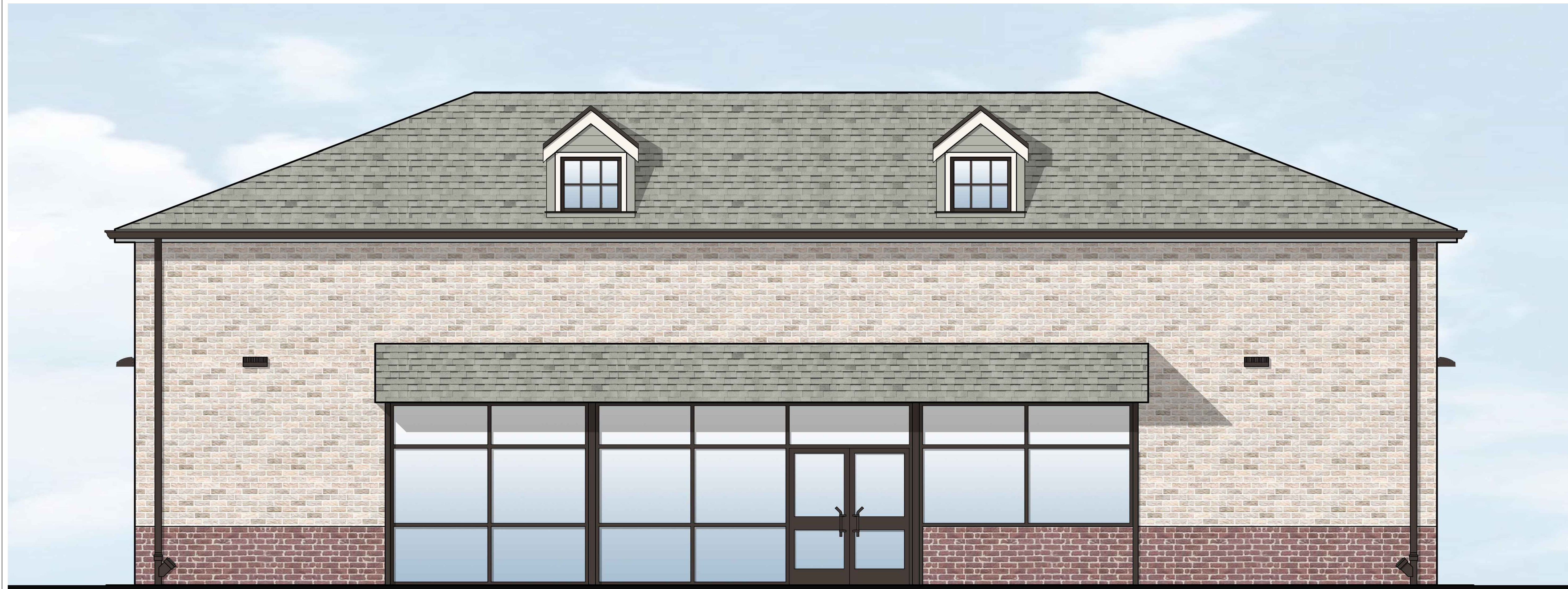
1 FRONT ELEVATION (WEST: SAW MILL RIVER ROAD)