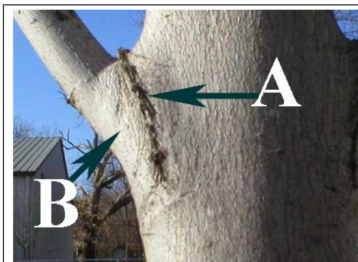
Figure 1. A photograph showing the branch bark ridge (A) and the branch collar (B) on a red maple.

Correct pruning of trees is a valuable maintenance tool and can help a tree stay healthy. Improper pruning can cause damage that will last for the life of the tree, or worse, shorten the tree's life. Trees that receive the appropriate pruning measures while they are young will require little corrective pruning when they mature. In most cases, mature trees are pruned as a corrective or preventive measure. Routine thinning of a mature tree does not necessarily improve the health of the tree.