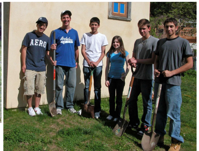
Eagle Scout Team

Rain Gardens are suitable for residential use when properly sited, and expert advice is needed for choosing placement.